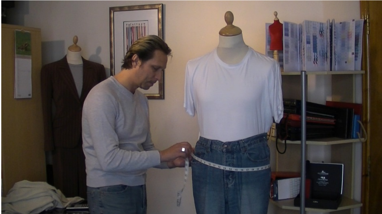
Measuring the hips.

With the tape measure you need to measure the waist, the hips the outside, the inside leg seams and the seat (crotch). For ladies measure waist to hip. Each time you measure record your measurement onto the measurement sheets.