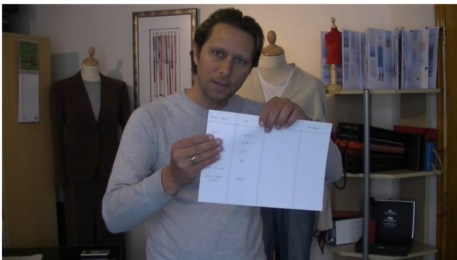
Make up your own measurement adjustment sheet as well as the original measurement sheet