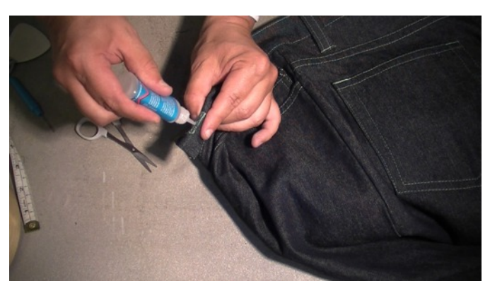
Use fray check or fabric glue to secure.