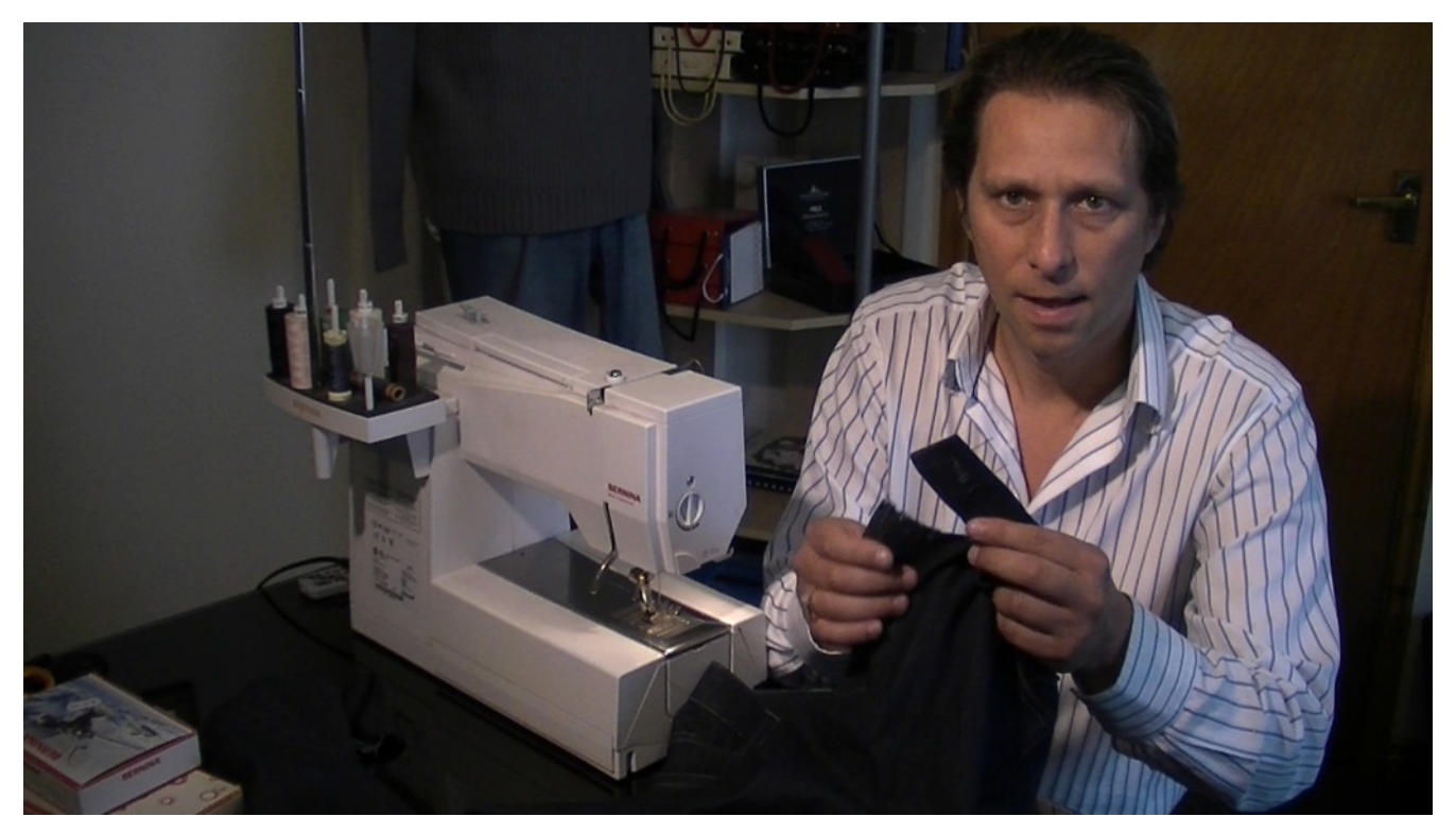
Tailors tip: detach part of the waistband to be able to implement the button hole.

To much bulk? If you find that you are having problems putting in the button hole due to the fabric bulk around the end of the waistband, detach a small part of the waistband from the top of the jeans as shown in the image below and then insert the button hole. This way gives the foot a flat surf ice to work with and results in a nice even button hole. When the button hole is sewn in place, the waistband can be reattached easily and quickly. When sewing in the key-hole button hole use your top stitching thread as to match the rest of your jeans.