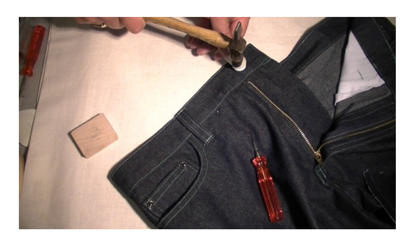
Apply the button in place with a few swift blows of the hammer.

With the button hole in place, you can attach the button in place. Close the front closure so that everything is aligned and put a pin through the key hole part of the button hole. Keeping the pin in place open the front closure and mark with tailors chalk where the pin is. This is now the mark for where the button is going to positioned. Apply the button in place with the jeans button set and a few swift blows with the hammer. This results with your button in place and the closure now fully functioning.