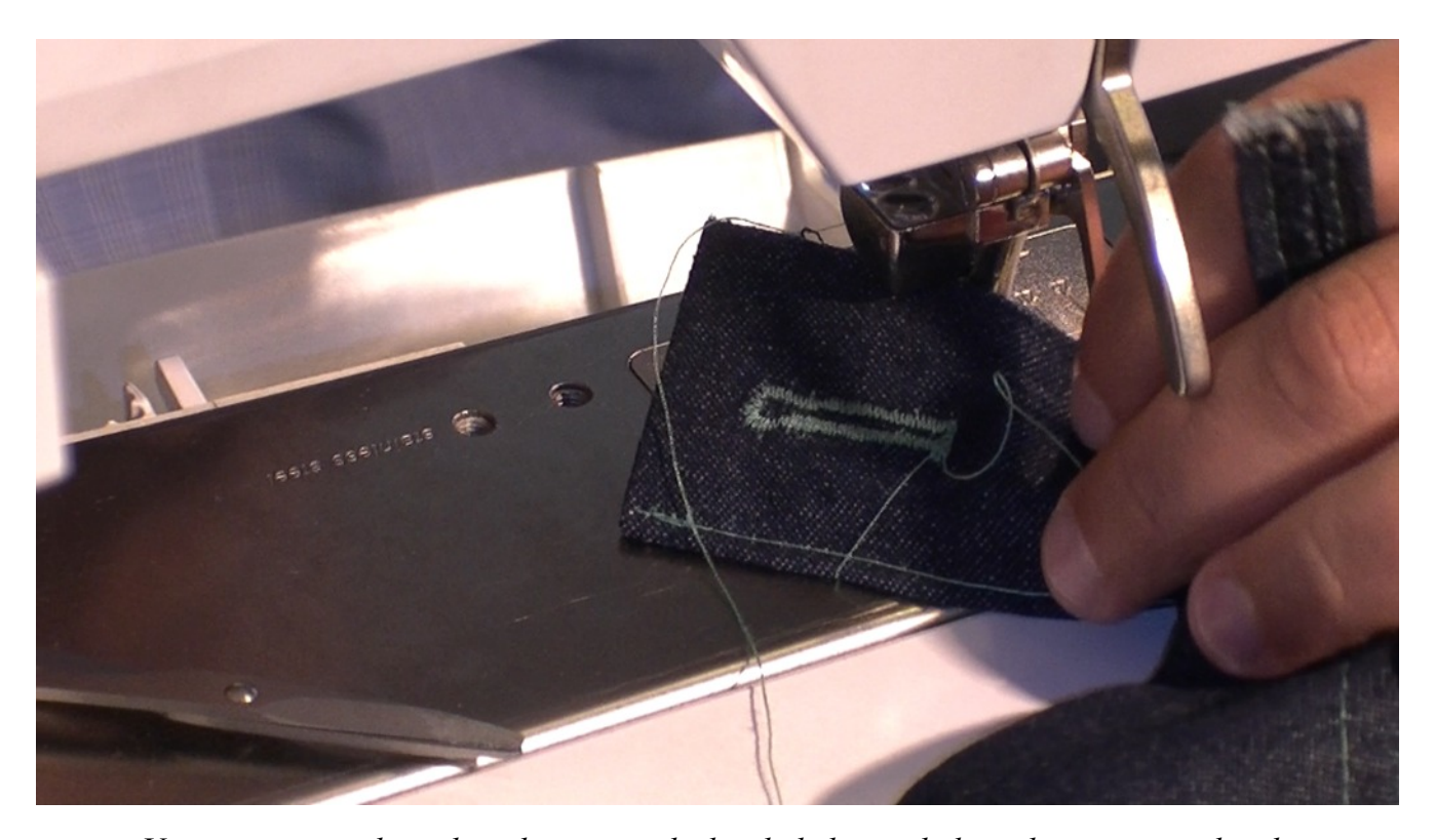
Use your top stitching thread to create the key-hole button hole in the jeans waistband.