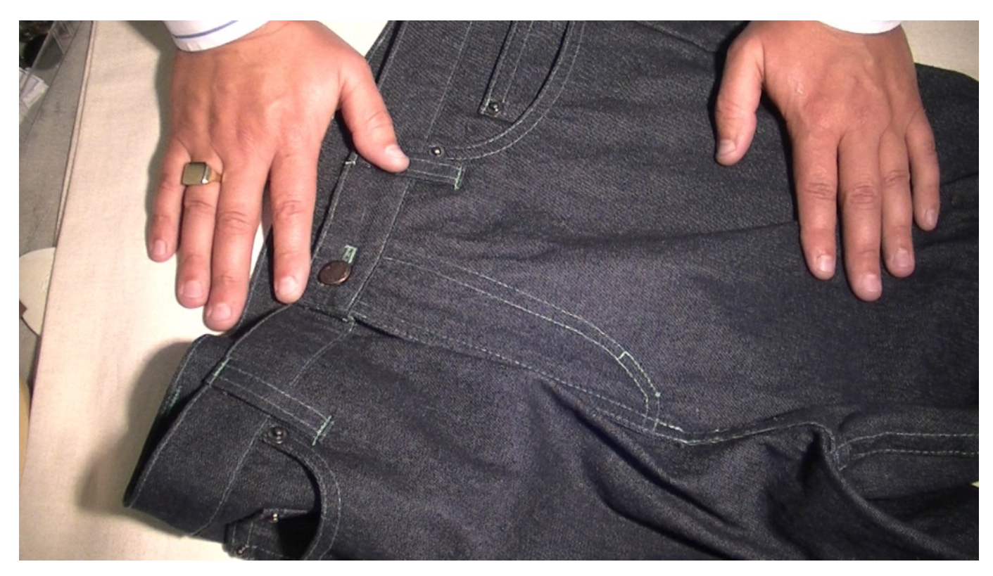
All the rivets, buttons and button holes are in place and your jeans are nearly finished.