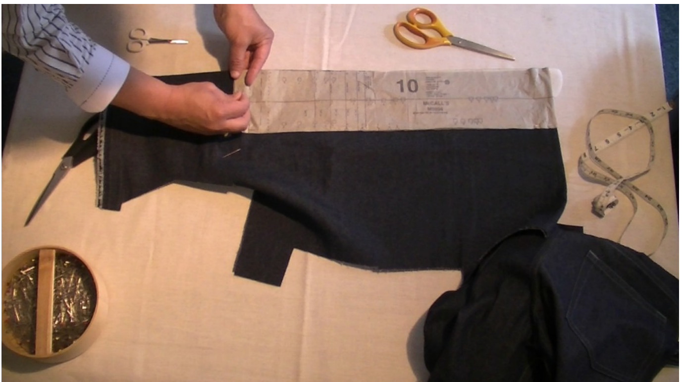
Pin the pattern to the fabric ready to cut the waistband out.

When you have measured the length that the waistband needs to be in order to fit the top of your jeans, the next step is to cut it out. Place the waistband pattern piece onto the fabric and mark on the length that you measured, this might be a longer length or a shorter length. Remember your 2 cm seam allowances on either side of the waistband. The width of the waistband will already be on your pattern so it is best to leave that and make your waistband exactly the same, the most important part here is to get the correct length as to fit your jeans. Pin your pattern piece onto the fabric to secure.