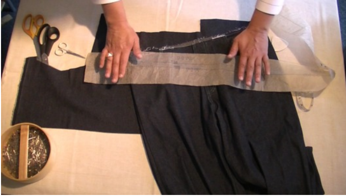
You will need a tape measure and your pattern.

So for this part you need a tape measure and the waistband pattern piece. When you measure the top of your jeans, open the fly and start at one end. Remember to add on 2 cm seam allowance for each end as you need this when you attach the waistband. Measure around the whole top of your jeans in one continuous line.