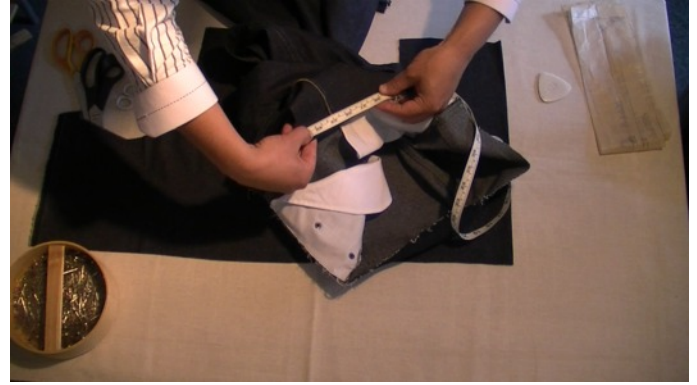
Measure around the entire top of your jeans.