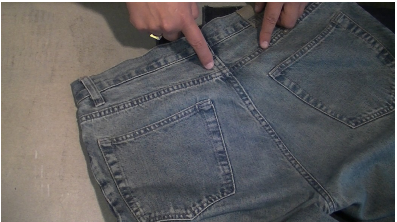
The back yolk panels on a pair of jeans.

The back yolks add shaping along with a decorative touch as they are all flat felled seams which carry the top stitching that you see throughout your jeans.